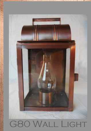
G80 WALL LIGHT