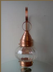
Onion Wall G57