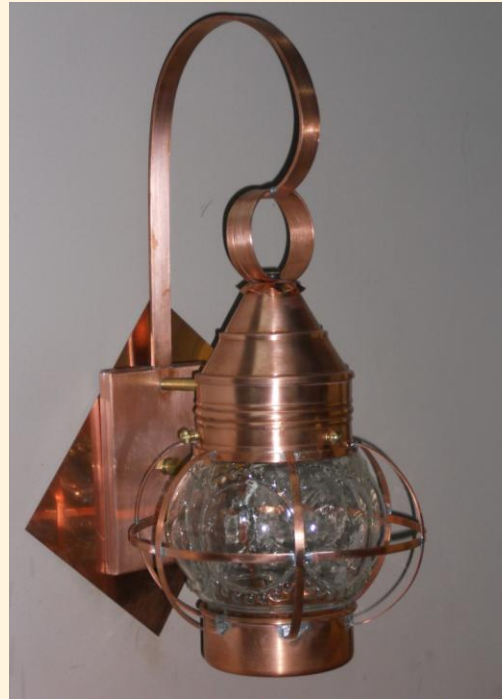
OUR SIGNATURE BULLSEYE ONION LIGHT

LUCKY STREET LANTERNS, LLC GULF COAST, FLORIDA