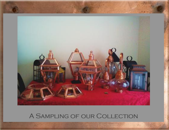
A SAMPLING OF OUR COLLECTION