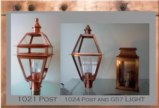
1021 POST 1024 POST AND G57 LIGHT